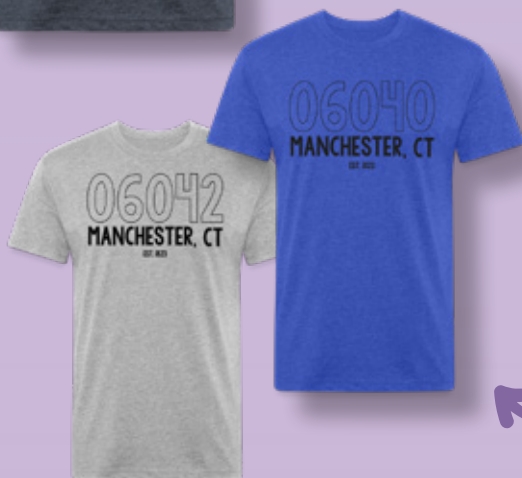
06040/06042 Specialty T-Shirt

Find this apparel and more by scanning the QR Code or visiting shopthestore.manchesterct.gov