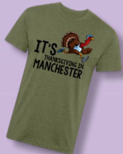
It's Thanksgiving in Manchester Specialty T-Shirt