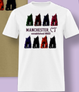
Love Manchester T-Shirt