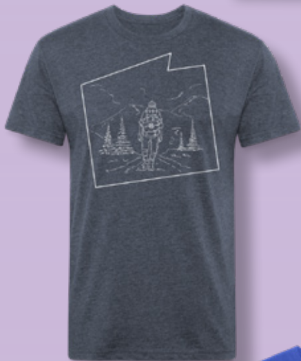
Trails Day T-Shirt